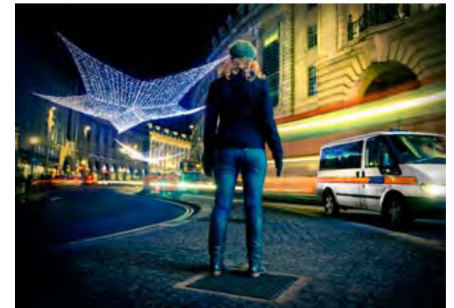
COMMENDED: 'London Lights' Andreas Andrews East Lancashire Institute of Higher Education (Blackburn)